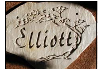
Sample Stepping Stone Opportunity

If you would like to donate or wish more information on this project, please contact Colene at 800 386 2324 x 22.